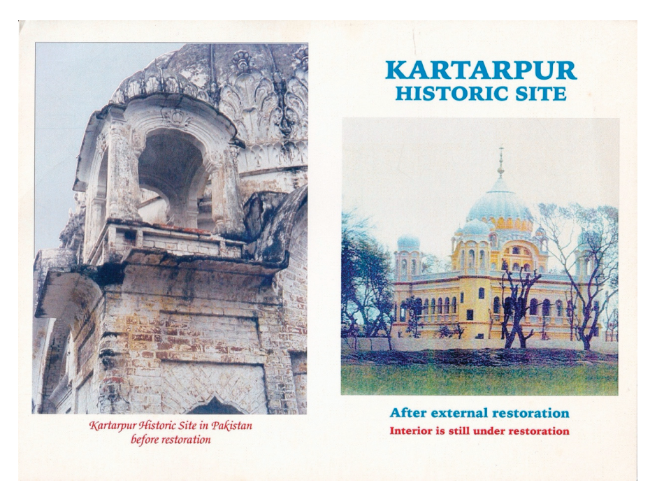
Figure 4. Side by side photos of Darbar Sahib, Kartarpur from 1992 (before restoration) and 1999 (post external restoration).