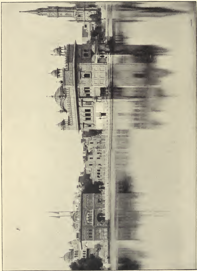
THE TANK AND TEMPLE OF AMRITSAR