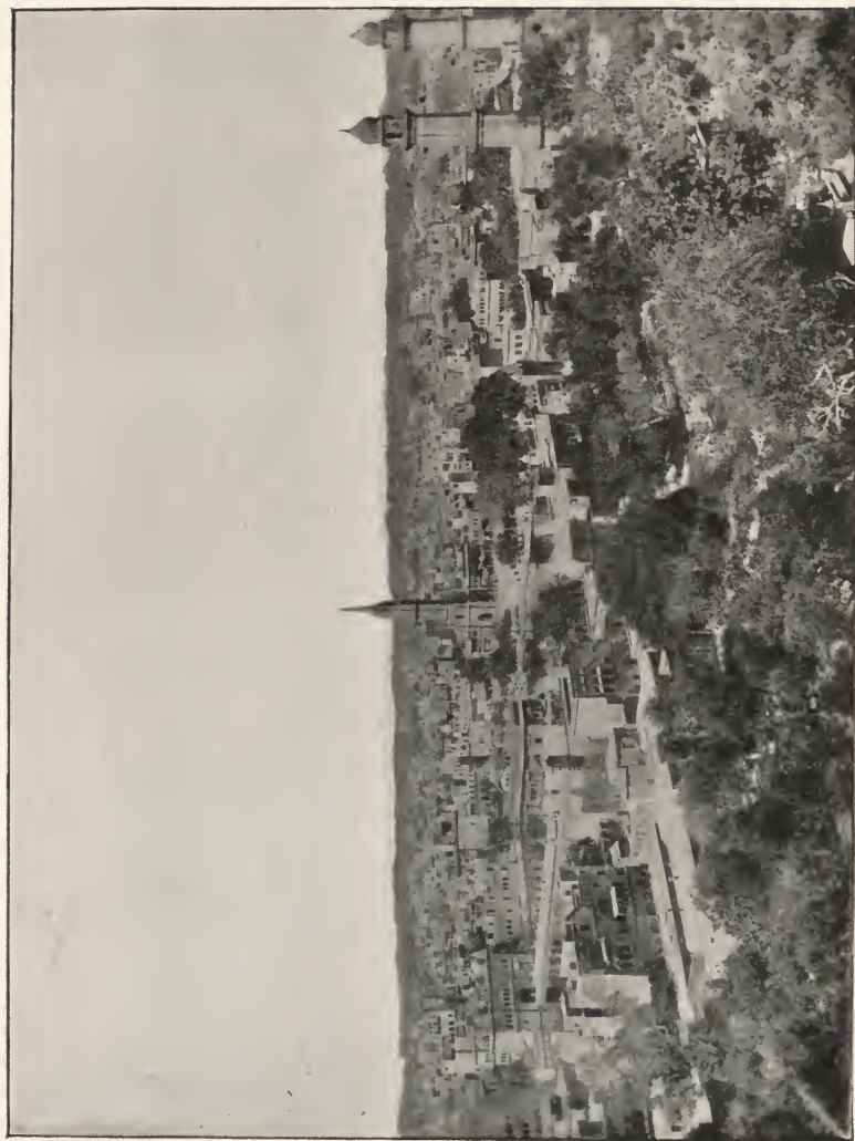
GENERAL VIEW OF AMRITSAR