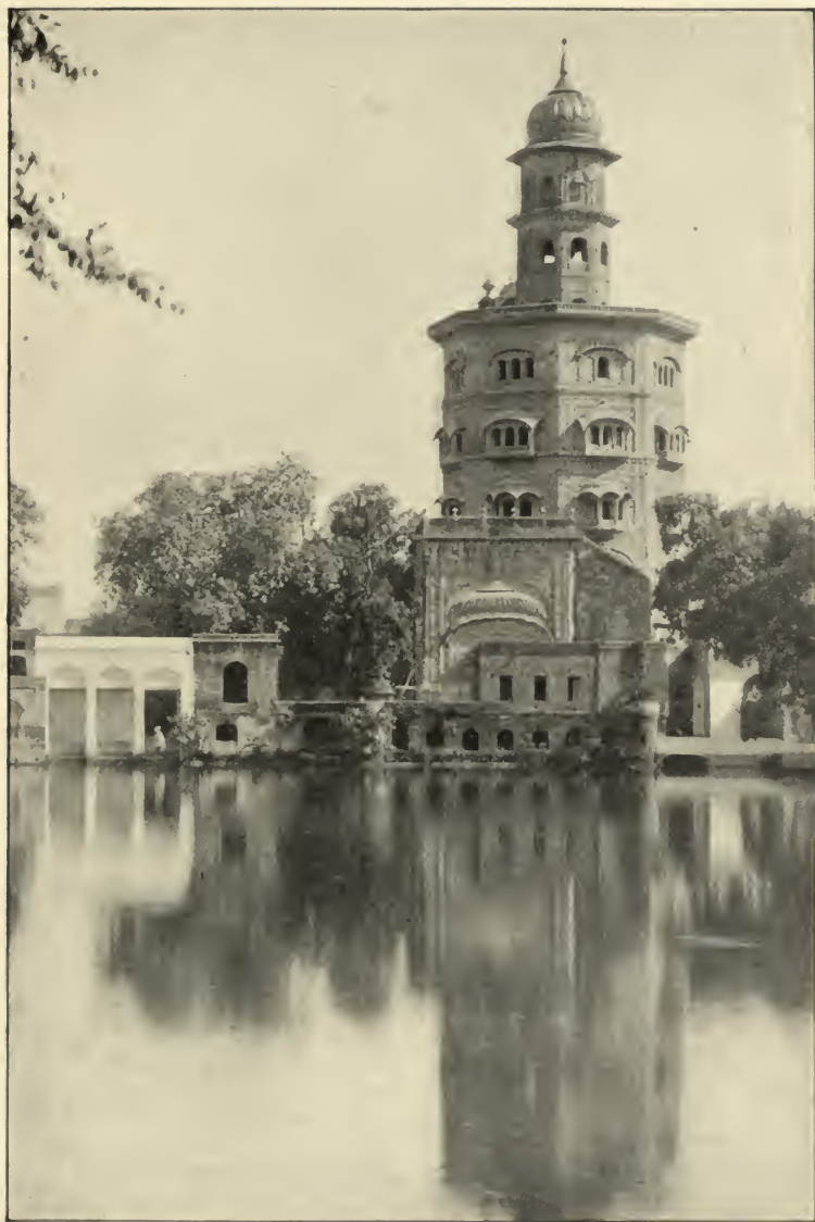
BABA ATAL'S SHRINE