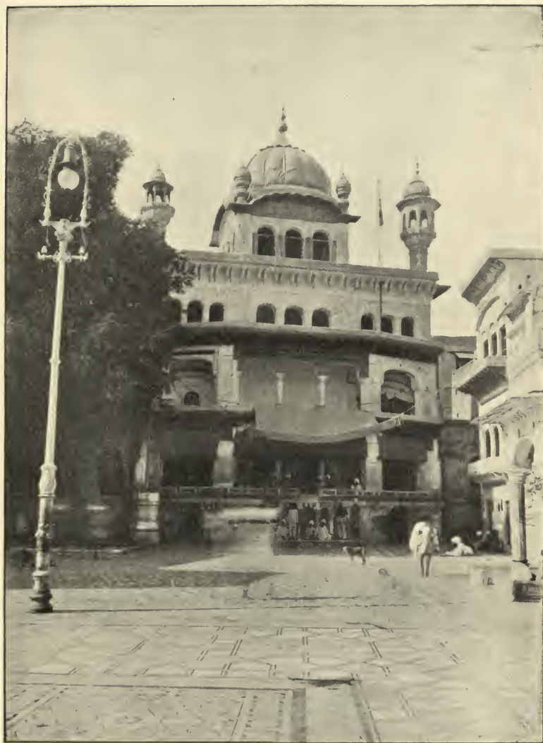
THE AKAL BUNGA