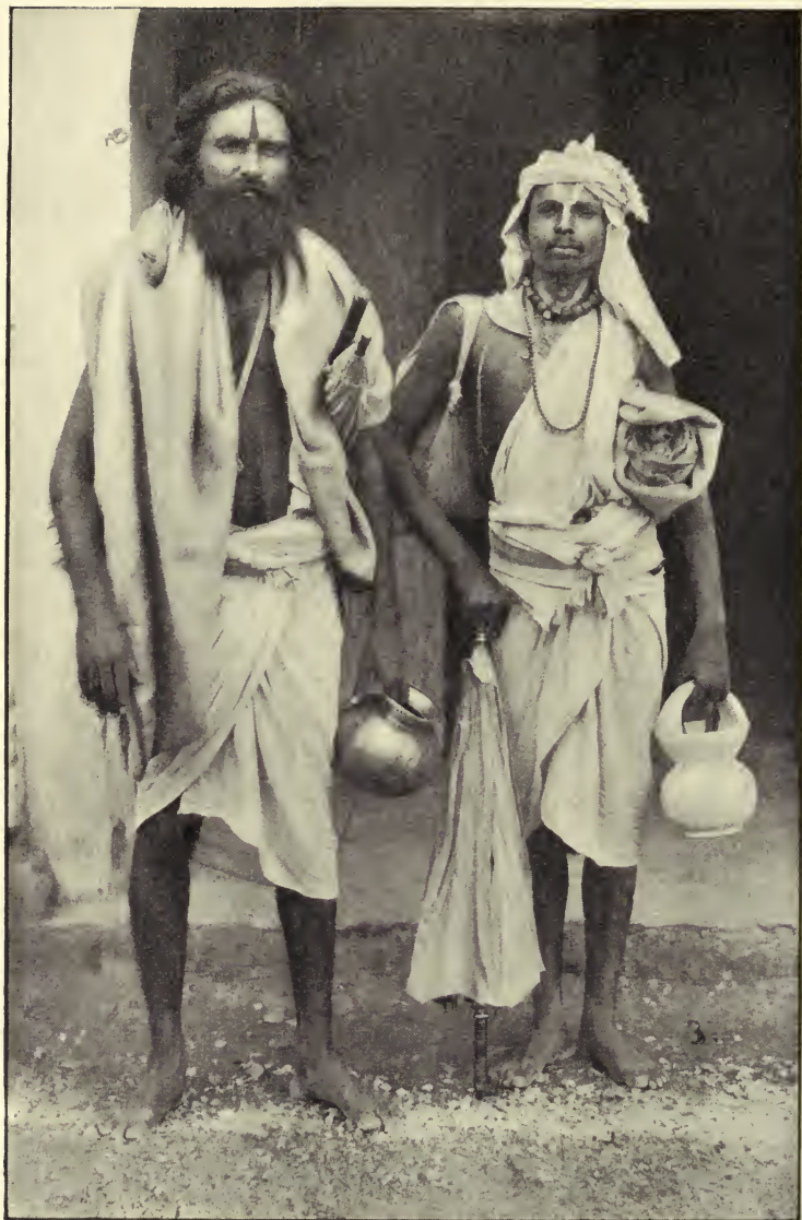
FOLLOWERS OF RAMANUJ AND RAMANAND