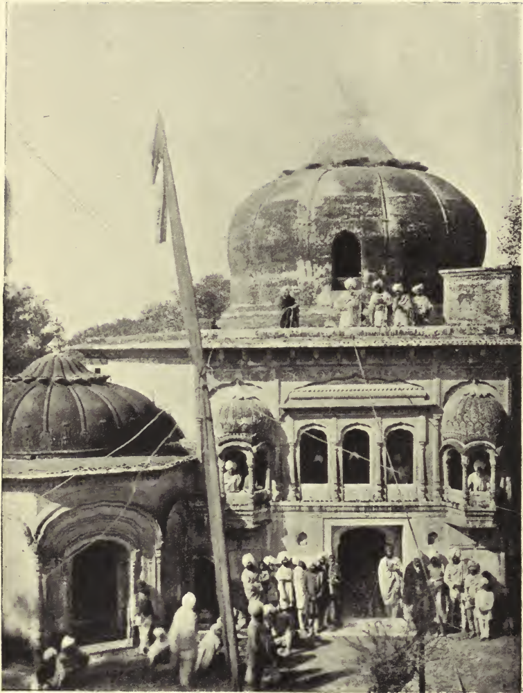
NAMDEV'S SHRINE AT GHUMAN